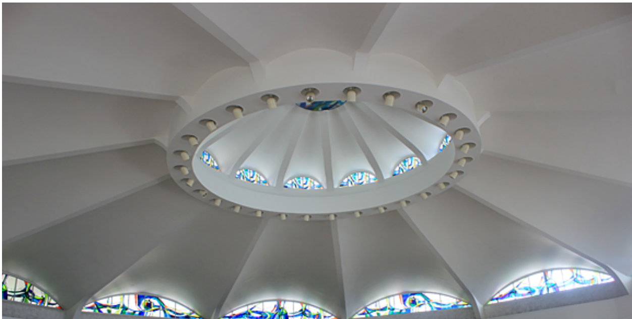
The Mystical Rose Oratory, a sanctuary created and maintained by the Marianist Order on the campus of Chaminade University, Honolulu

On August 3, we will find out: “ Silence and Forgiveness. ” Complimentary reserved tickets are available now, at http://www.hawaiiforgivenessproject.org/reservations/