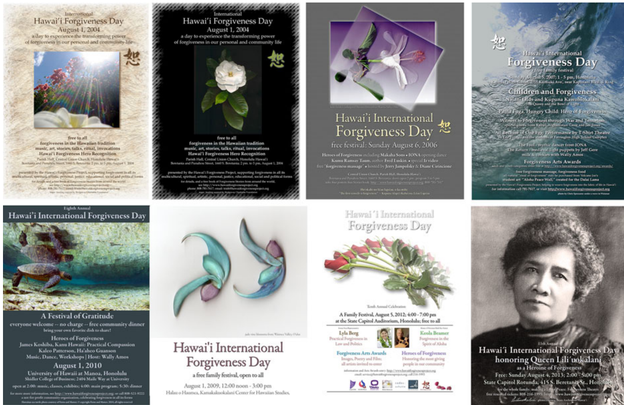
Posters Past: selected from the first 11 years of festivals by the Hawaii'i Forgiveness Project

Sincere thanks to the good people at Chaminade University, to our Silence Guides, and to the hundreds of people and scores of organizations who provide their selfless support. Full details at http://www.hawaiiforgivenessproject.org , or call 521-9222.