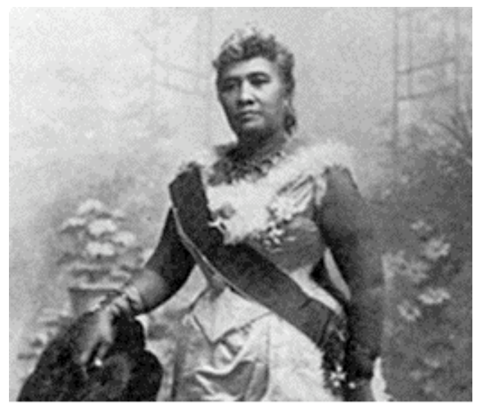
O kou aloha nô Aia i ka lani A 'o Kou 'oia 'i'o He hemolelo ho`i