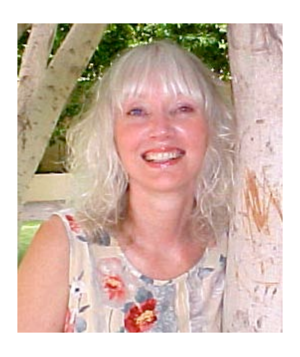
First Nations People: Canada